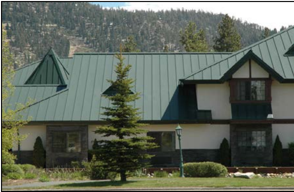
(Above) The only difference is an hour in time and the changing angle of the sun

Conditions such as the time of year, the viewing angle, and the angle at which sunlight strikes the panel may also have an impact on the ability to discern oil canning. The eye perceives the reflection of light, and when the reflective surface is irregular the reflected light is also irregular making it more perceptible. If oil canning is present, it is usually apparent at the time of construction.