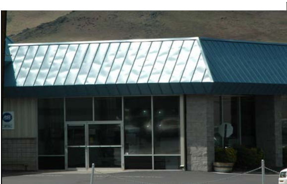
(Above) These photos were taken minutes apart, from different camera angles